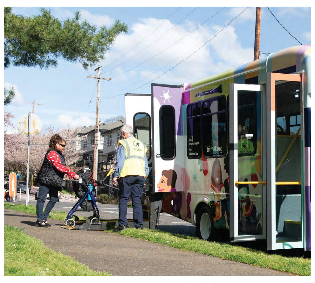
A LIFT operator (right) greets a customer as they board the vehicle.

Cancel as soon as possible and more than 1 hour before the scheduled pick-up time to avoid a No-Show. If you have scheduled a return trip that you no longer need, be sure to cancel that, as well. Canceling in advance helps our system run on time and avoids risking a No-Show penalty.