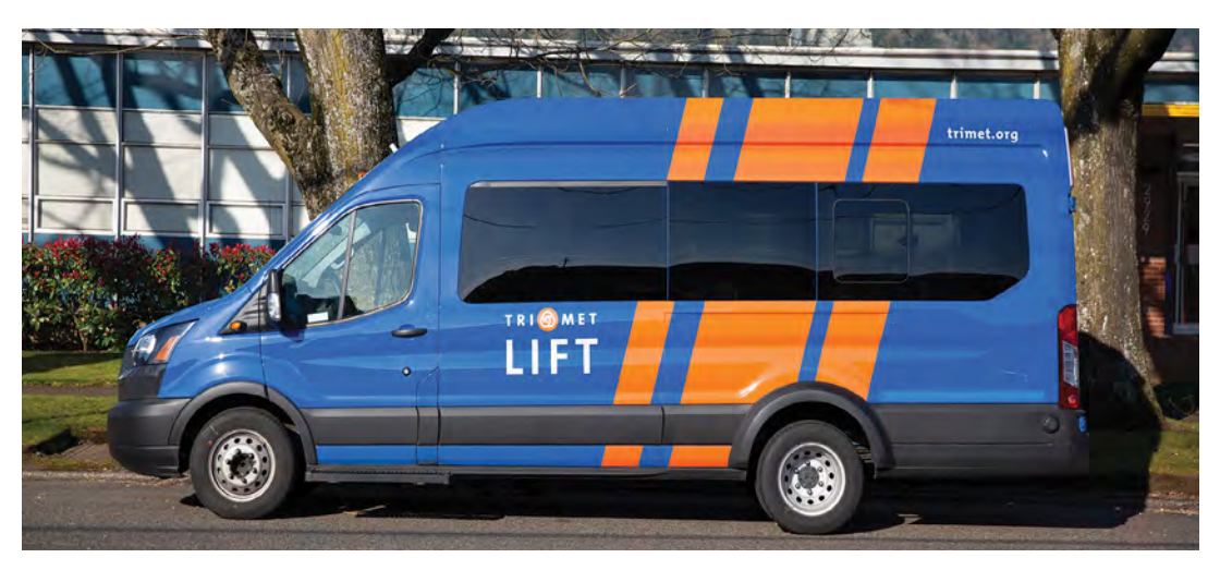
New LIFT vehicles are blue with orange stripes and say "TriMet LIFT."

LIFT has several different vehicle types that customers should look out for. There are large cutaway buses, slightly smaller buses and Transit vans. These LIFT vehicles all have a large TriMet logo and blue and orange or white coloring.