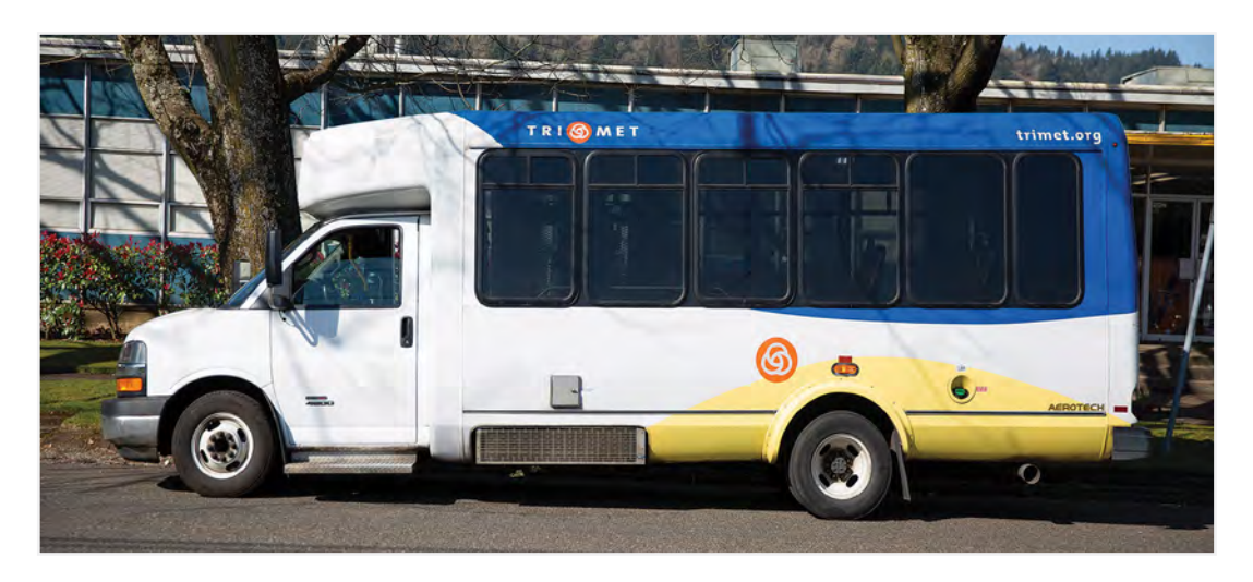
Earlier LIFT vehicles are mostly white with blue and yellow trim.