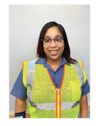
A LIFT operator may wear a white or blue uniform with a "Transdev" patch.