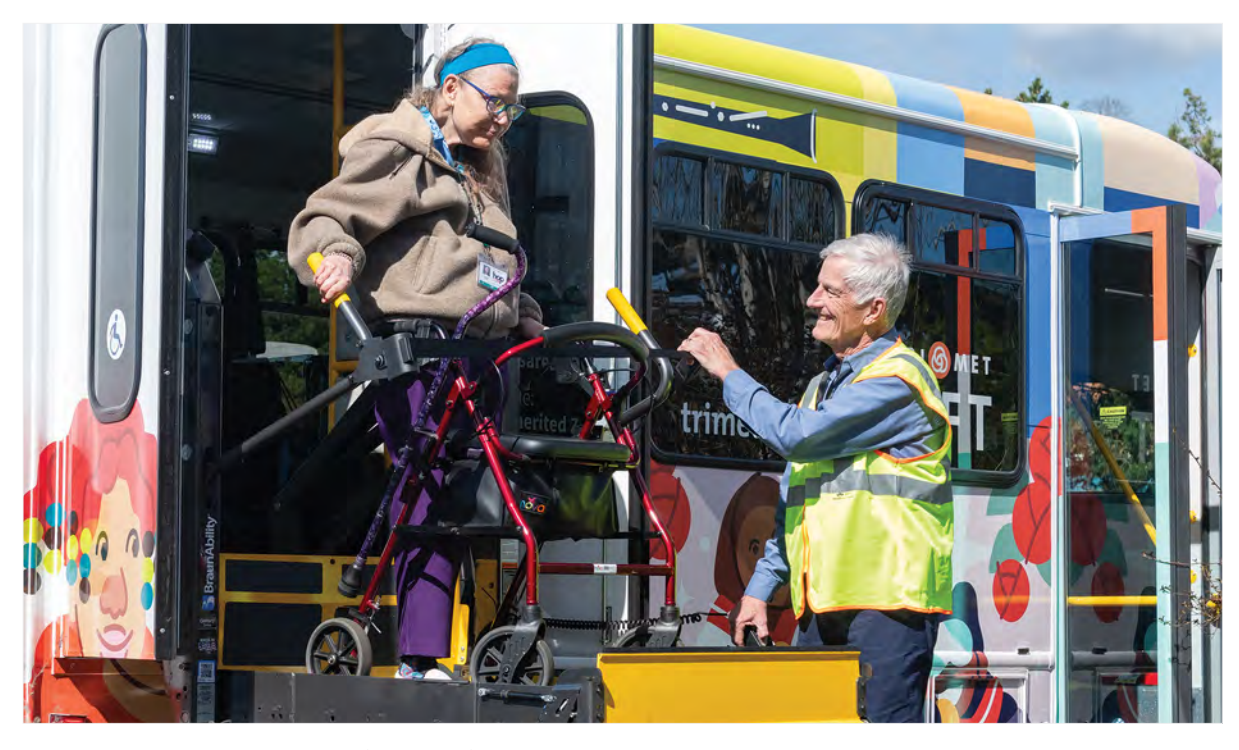
A LIFT operator (right) lowers the vehicle lift for a customer.

If you need additional assistance beyond what is listed above, you may bring a Personal Care Attendant (PCA) with you on the trip. A PCA can accompany an eligible LIFT customer at no additional charge. You must reserve space for the attendant when scheduling your trip.