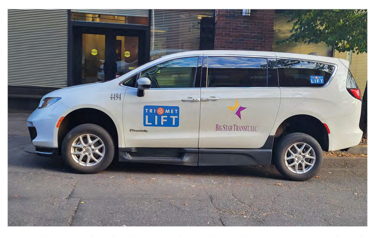
Supplemental vehicle providers show the TriMet LIFT decal.