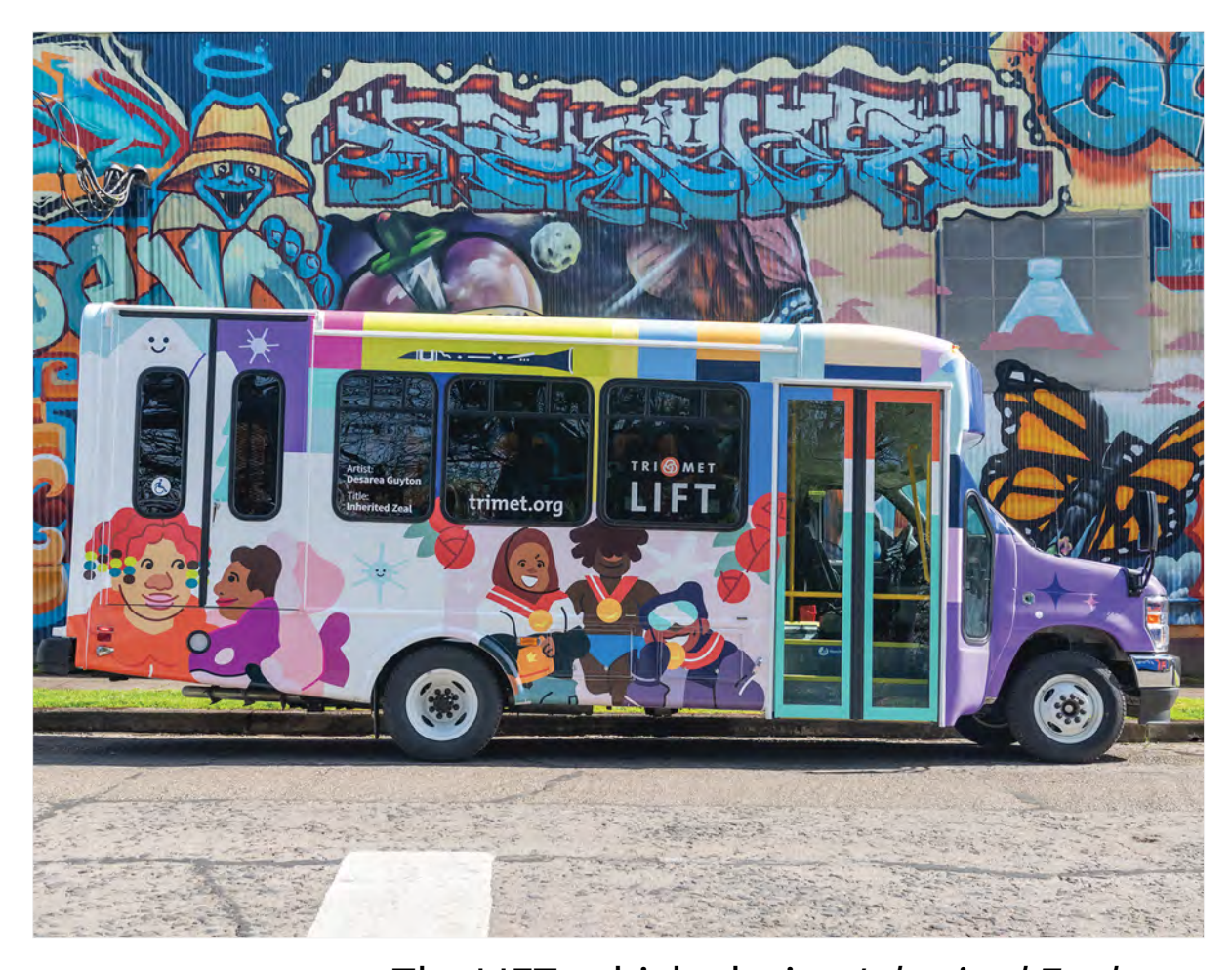
The LIFT vehicle design Inherited Zeal was created by artist Desarea Guyton.

The presence of a disability or a disabling health condition by itself does not make a person eligible for LIFT. Eligibility is also not based on age, income, inability to drive or the lack of availability or inconvenience of fixed-route services. The eligibility decision is based on the applicant's functional ability to use the fixed-route bus and is not a medical decision.