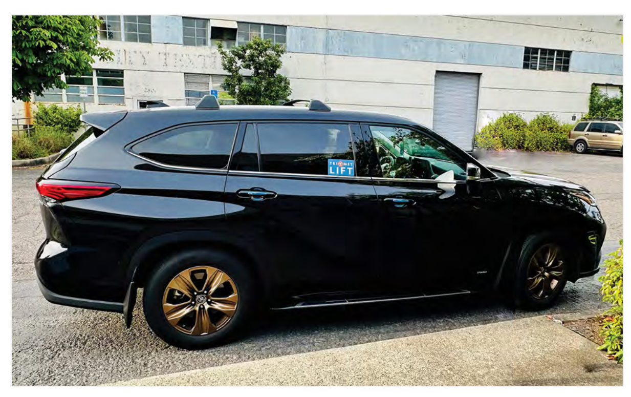
Supplemental vehicle providers show the TriMet LIFT decal.